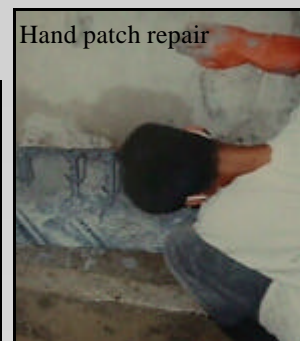
Hand patch repair