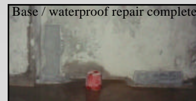
Base / waterproof repair complete