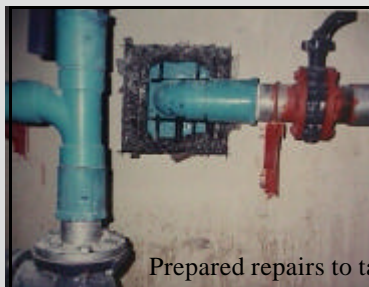
Prepared repairs to tank wall penetrations