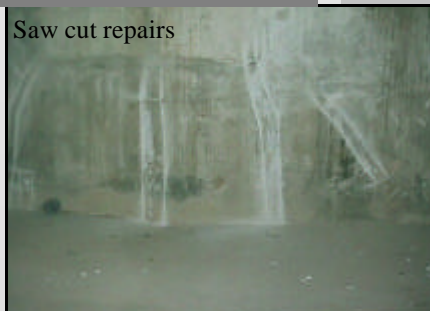
Saw cut repairs