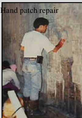
Hand patch repair