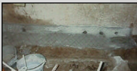
Hand patch repair