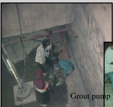
Grout pump repair