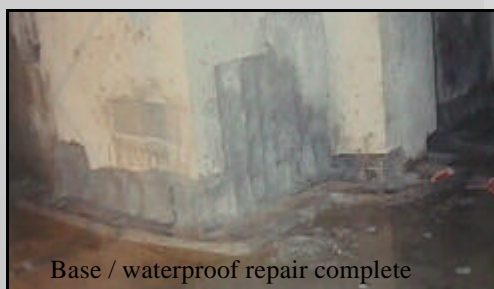
Base / waterproof repair complete