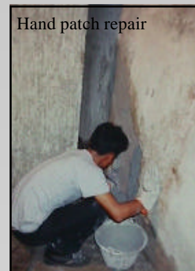
Hand patch repair