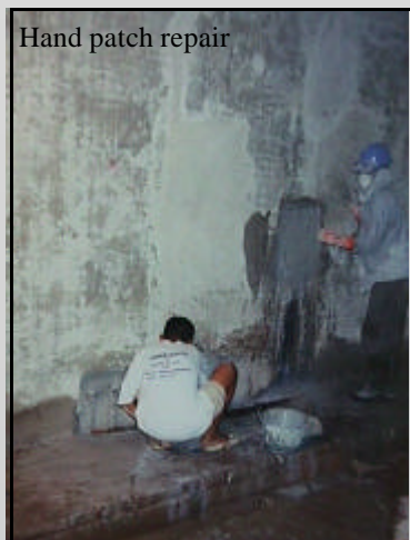
Hand patch repair