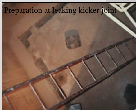
Preparation at leaking kicker joint